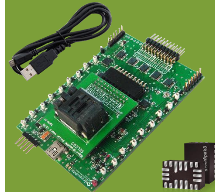
GreenPAK Universal Development Kit